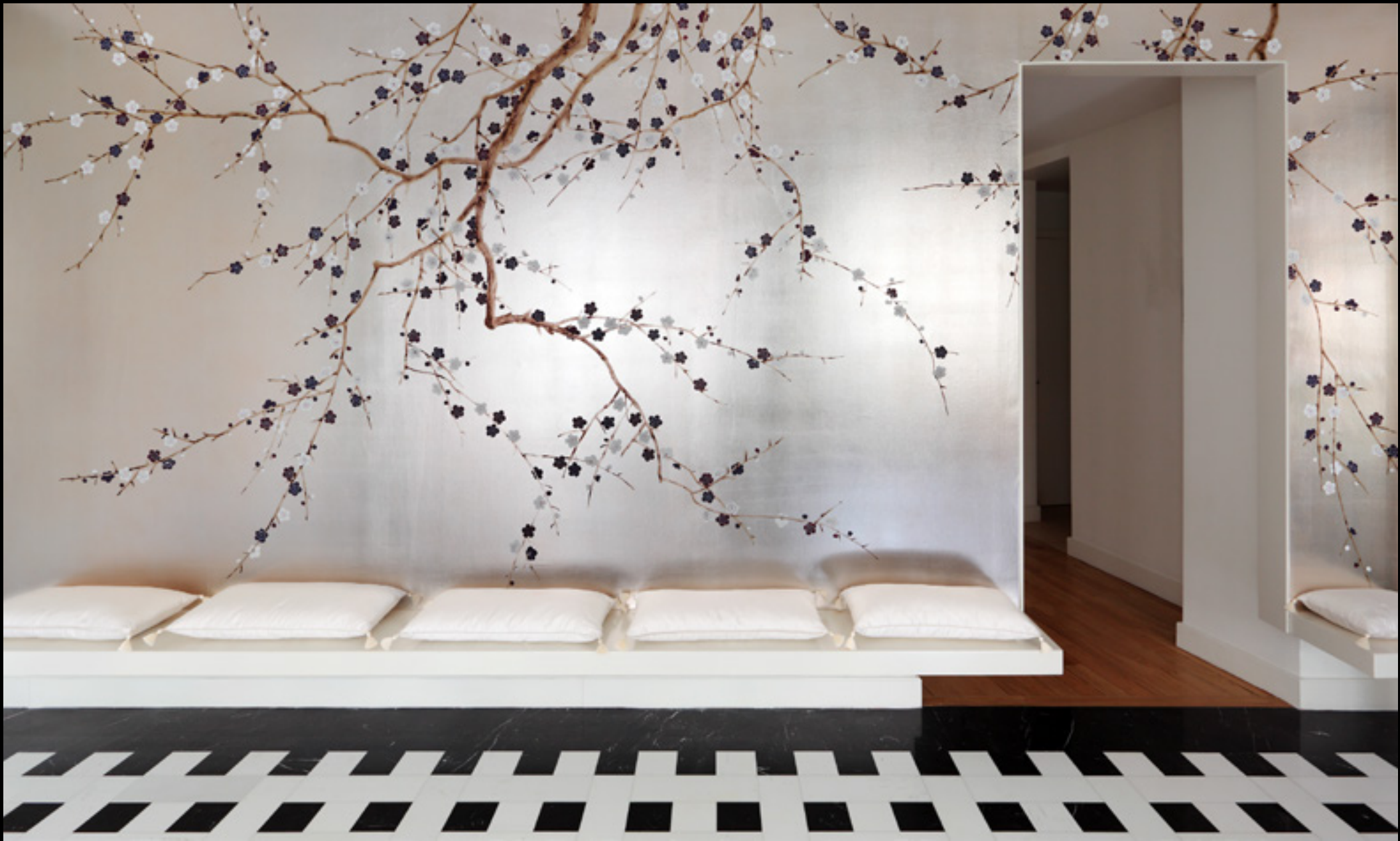
Plum Blossom wallpaper in Hokusai design colours (painted in Lavender painting style) on Tarnished Silver gilded paper. Interior design by Tapet Café