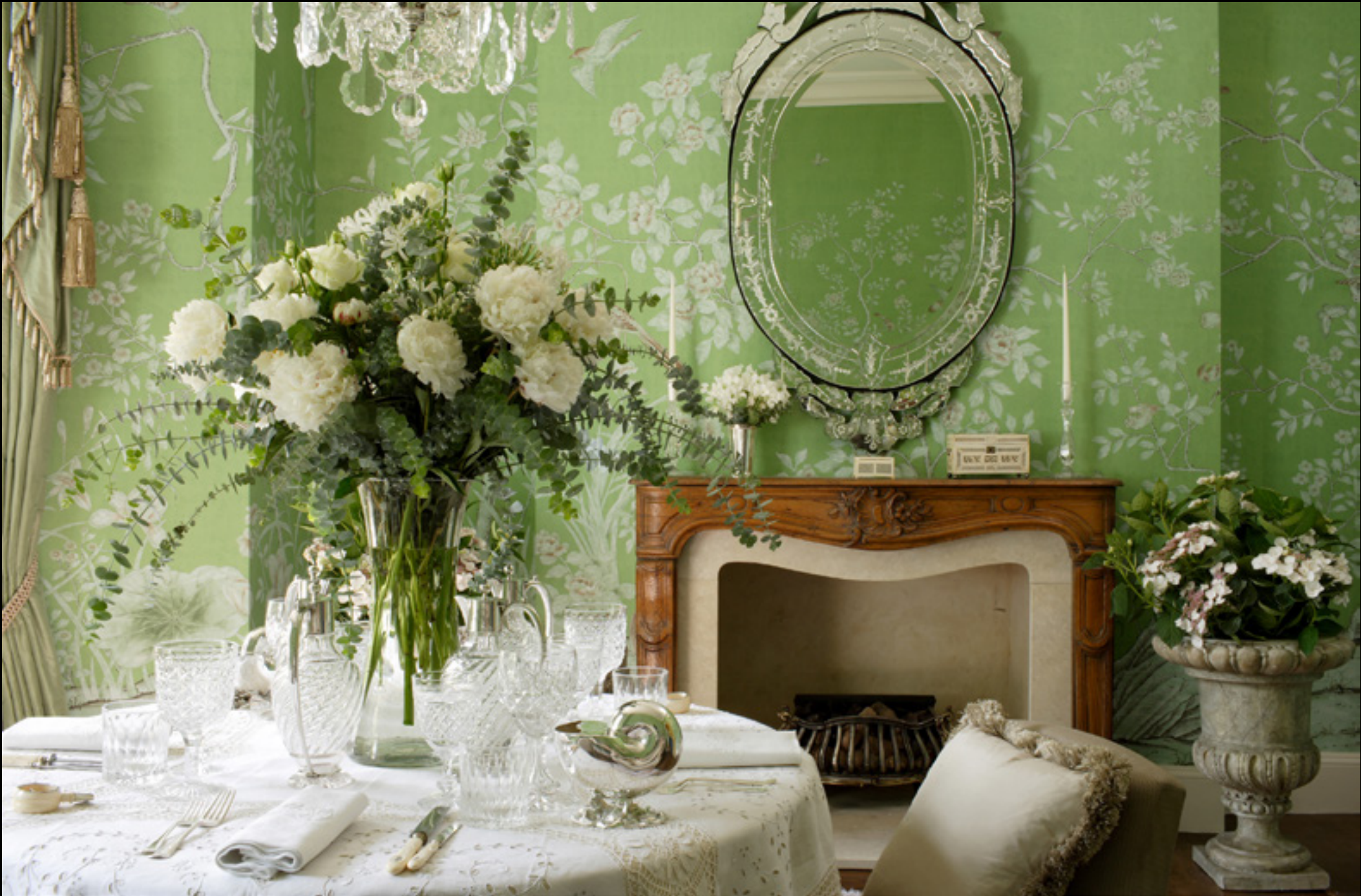
Askew wallpaper in full custom monochromatic design colours on custom Green williamsburg. Design by Alison Henry Ltd