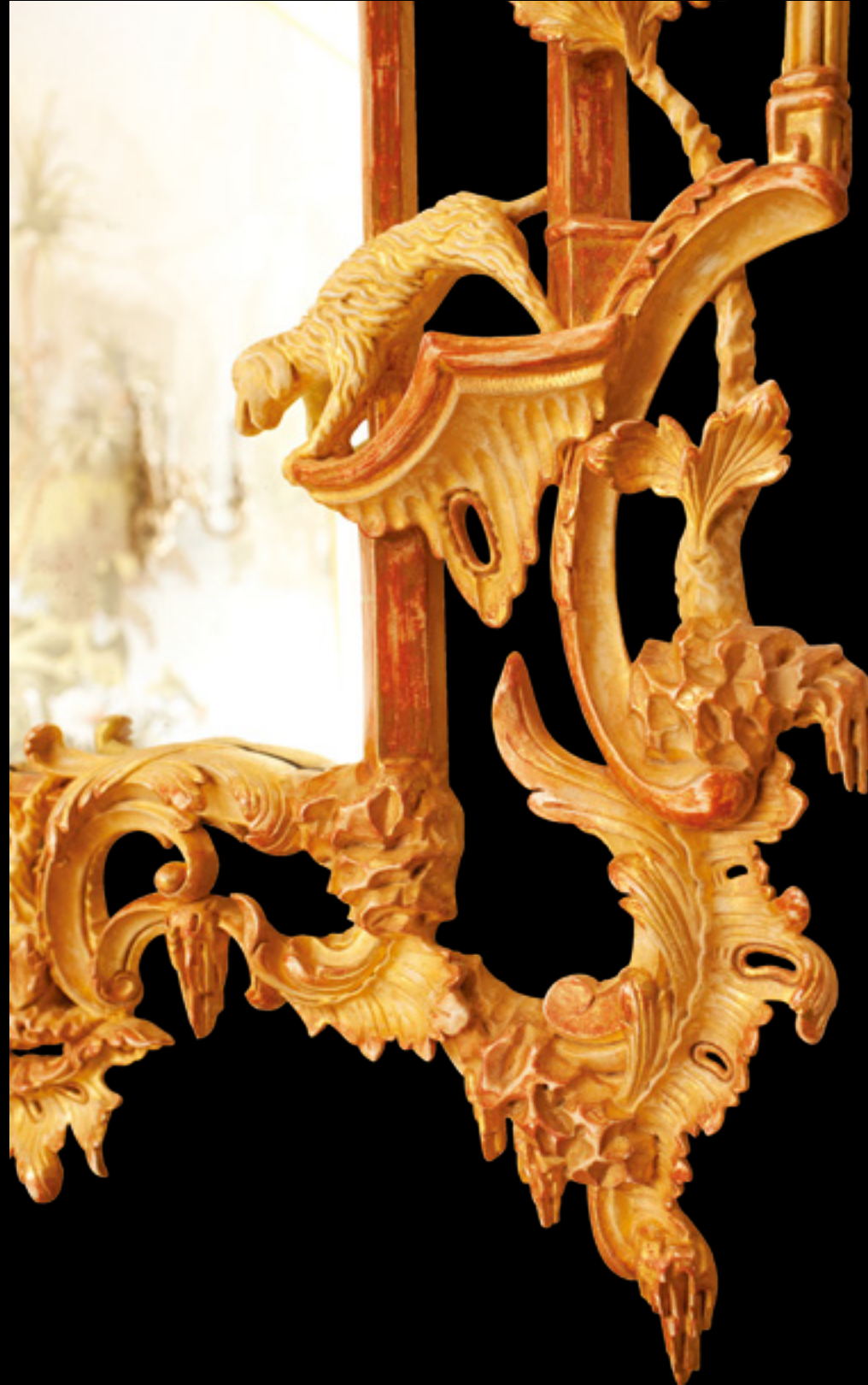
de Gournay Thomas Johnson George III (C 1760) Mirror (MR3) Above:Valois (M4B) finish. Opposite:Anjou (M5B) finish. Dimensions: 2050mmH x 950mmW