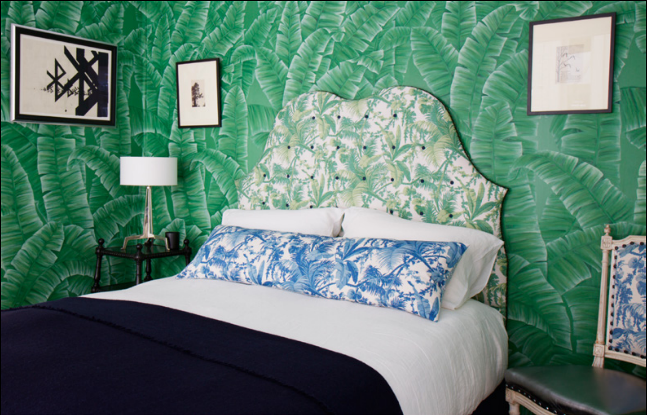
Aruba design in Original colourway hand painted on dyed paper. Photography by Natalie Dinham. Stylist Tara Craig