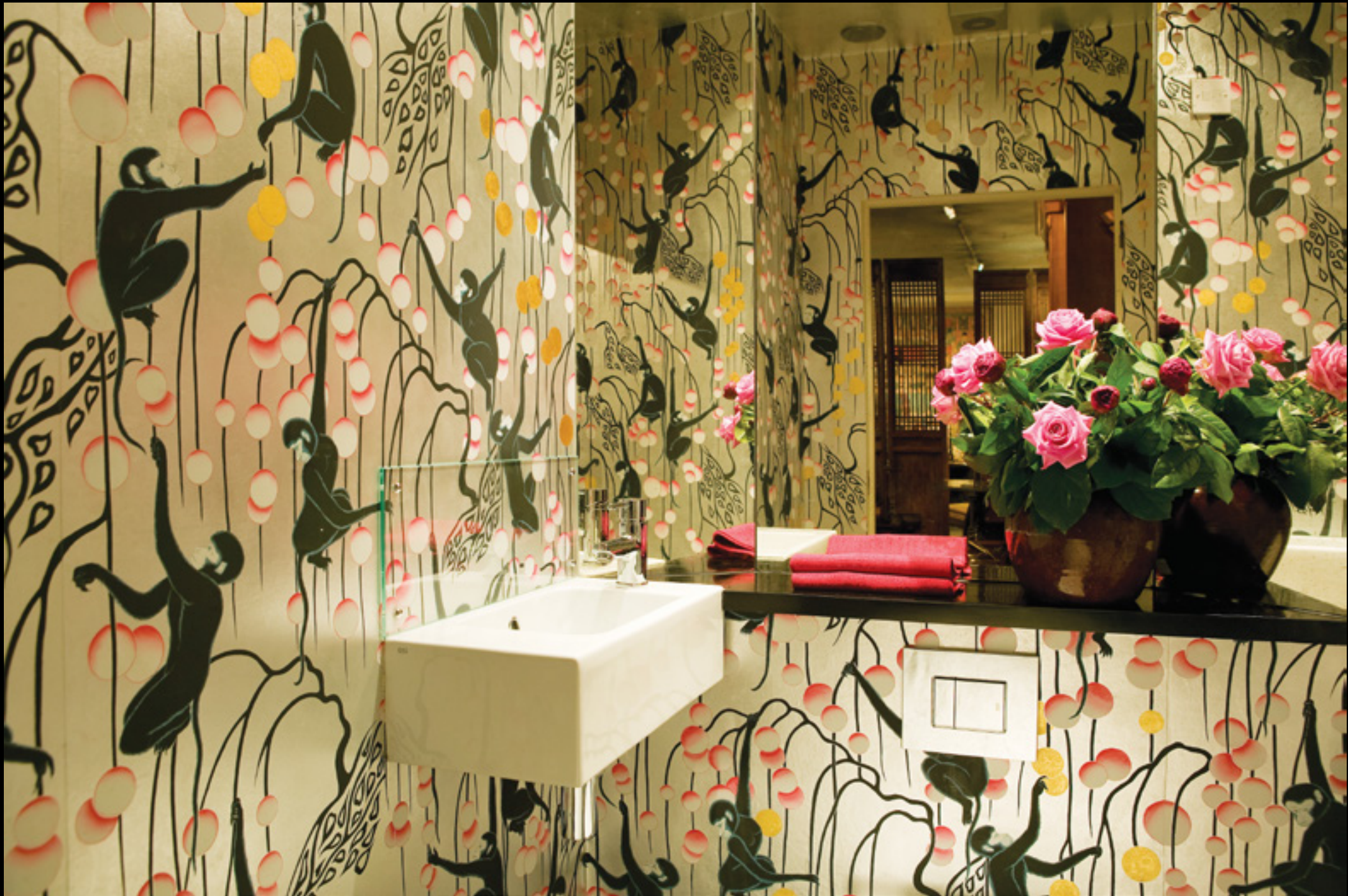
Deco Monkeys wallpaper in part custom colour on sterling silver gilded paper