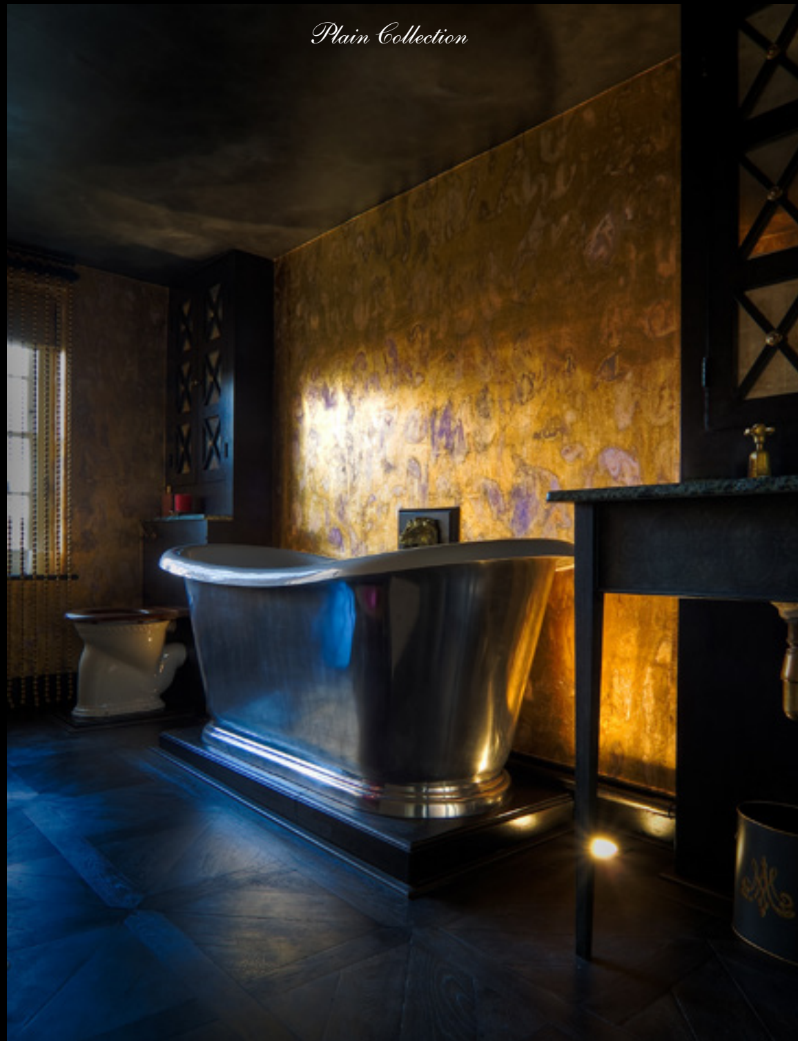
Old Gold gilded paper with Pearlescent antiquing Bathroom designed by David Carter Interior Design