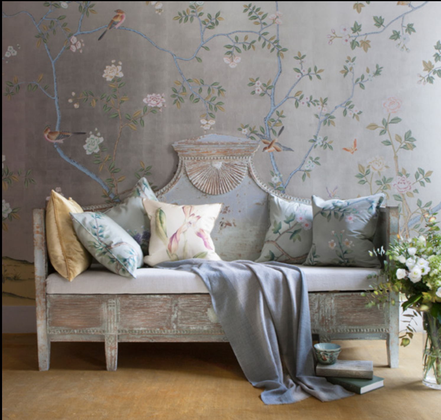
Badminton wallpaper in Standard colours on 12 Carat White Gold gilded silk