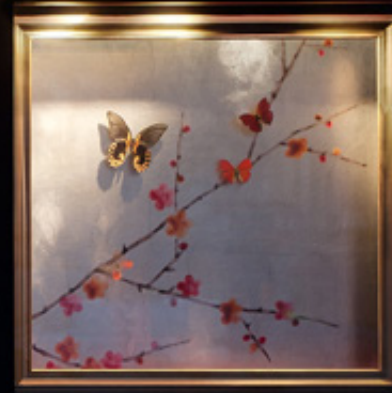
Dior window display