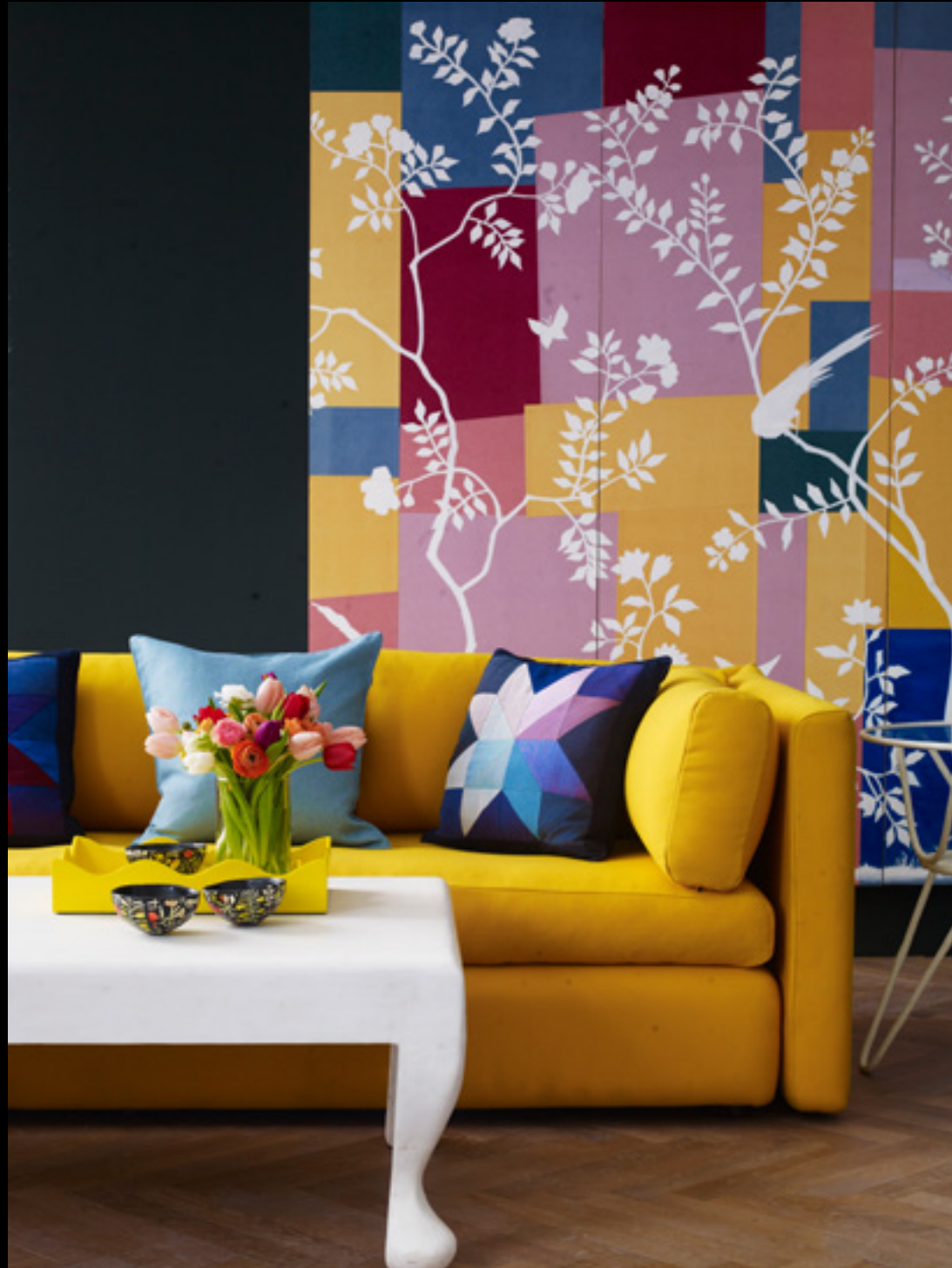
Chinoiserie designed in the style of 'Matisse'