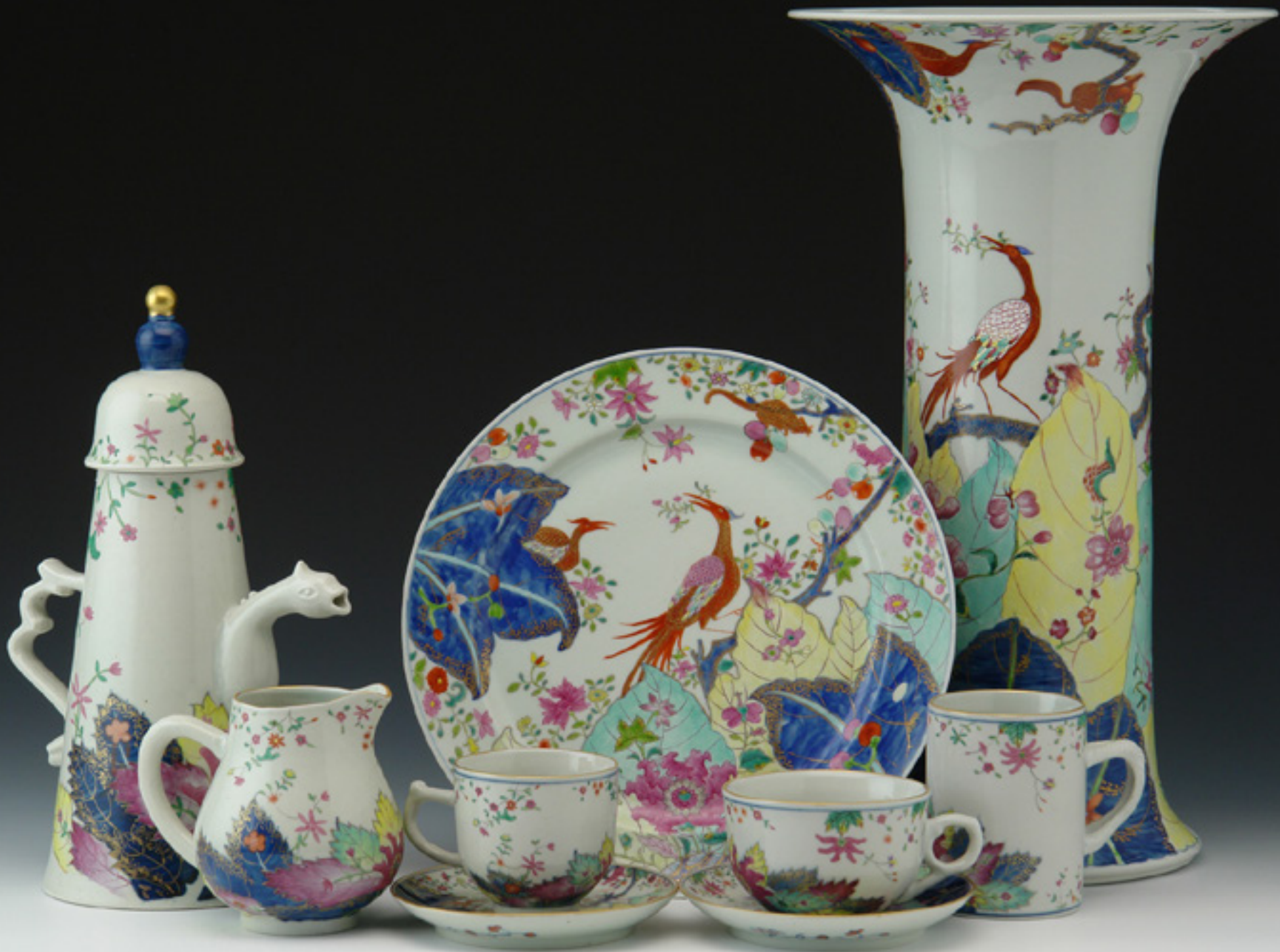
Tobacco Leaf design in standard design colours on Pearl porcelain