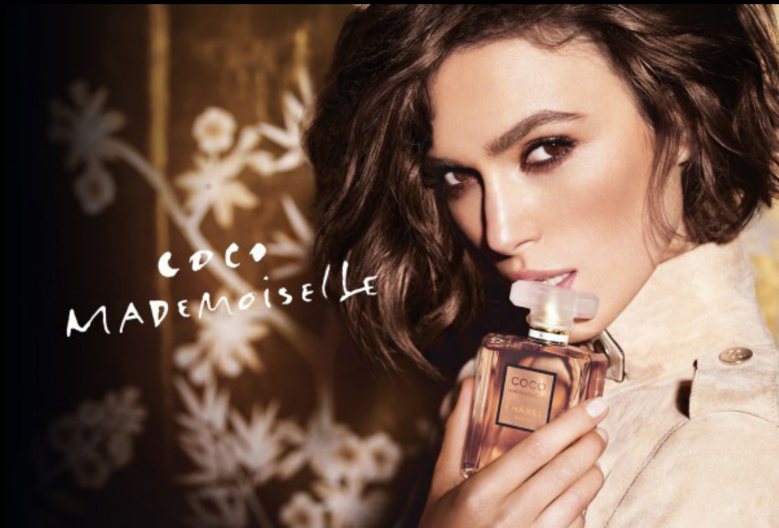
Coco Mademoiselle by Chanel