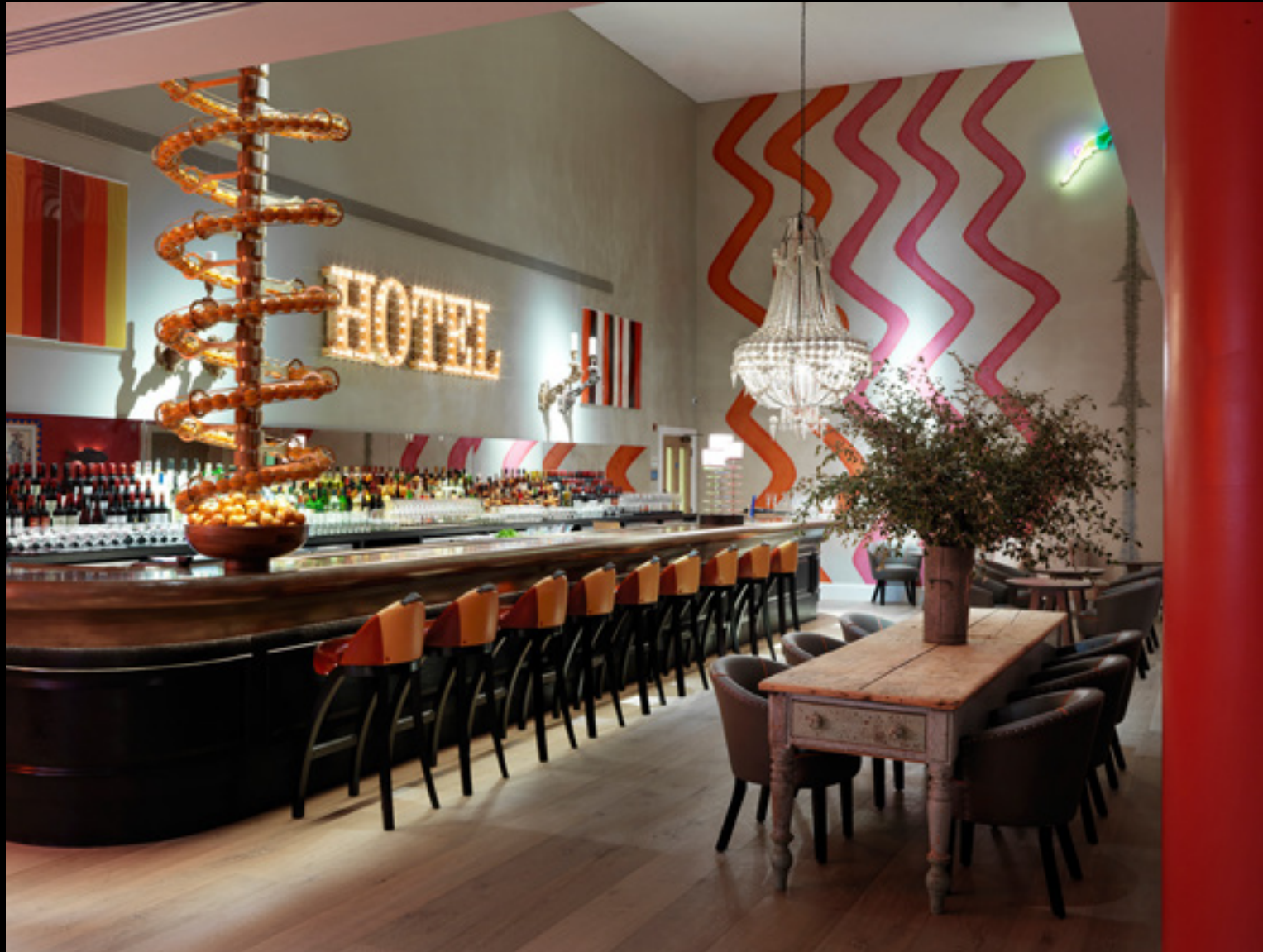
Ham Yard Hotel, Firmdale Group, London