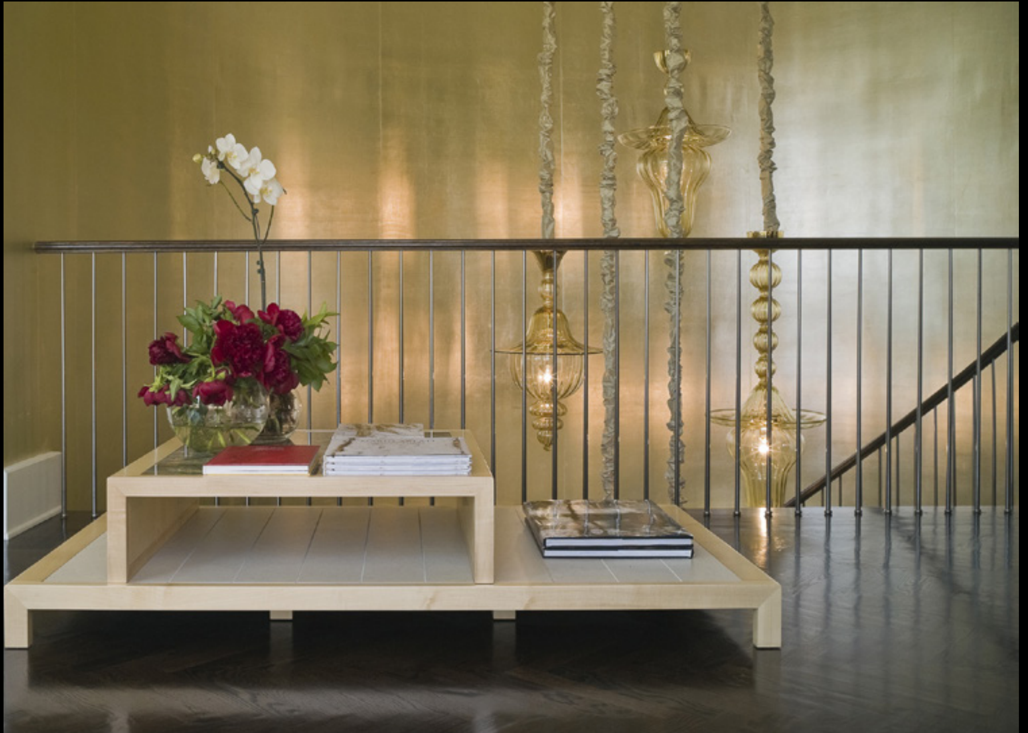
White Metal gilded paper.