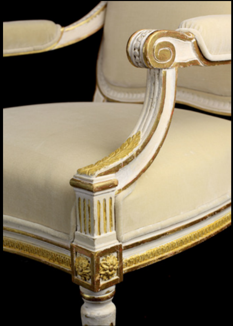
Louis XVI Fauteuil à la Reine (FR1) in Cheverny finish (F4S), upholstered in de Gournay's Polar Bear silk velvet. 670mm wide x 980mm high x 600mm deep