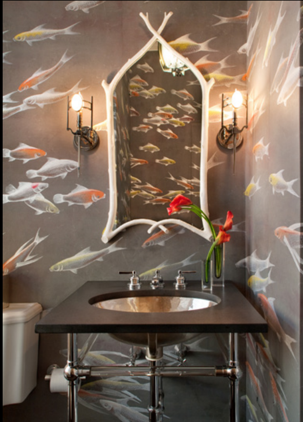
Fishes wallpaper in Koi design colours on Edo Night painted xuan paper