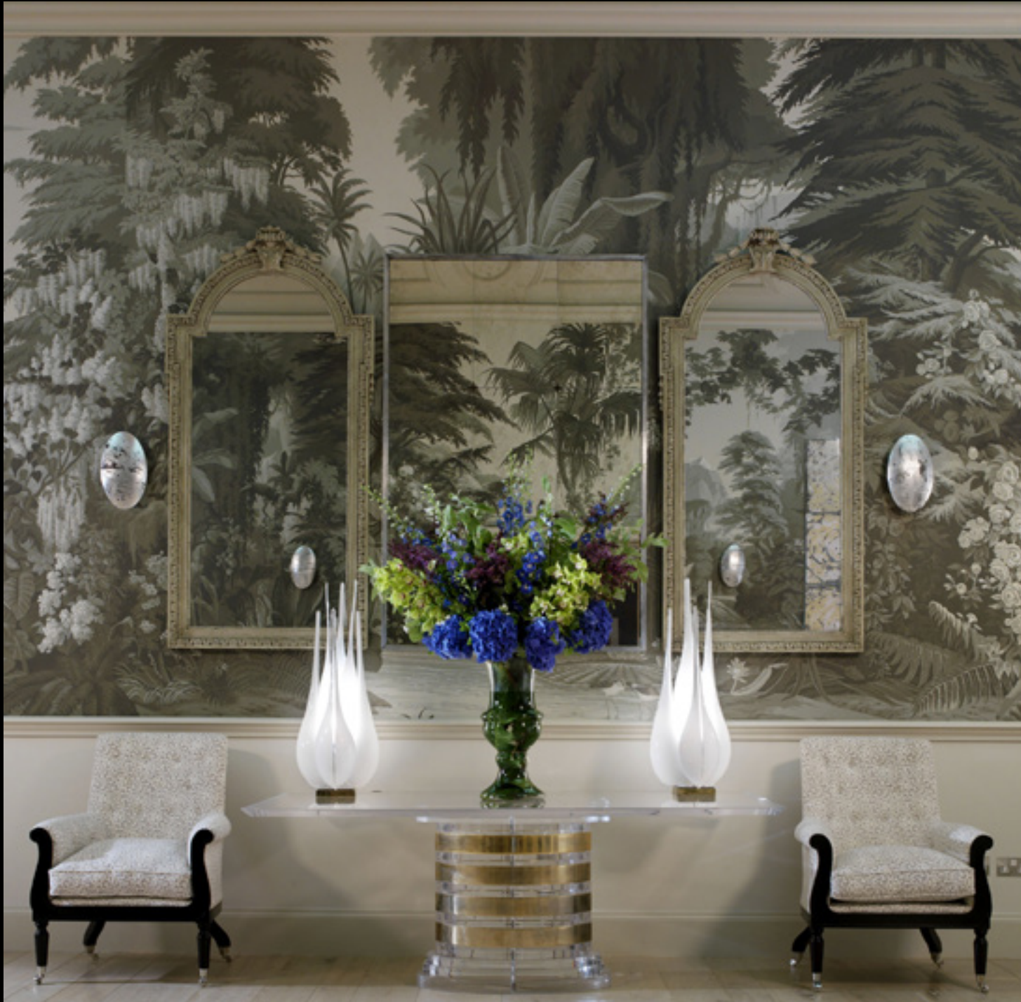
L'Eden wallpaper in Crystal Grey colourway on scenic paper. Haymarket Hotel, London